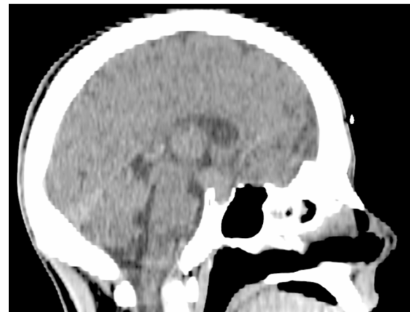
Figure 3 Sagittal computed tomography scan showing a pituitary mass.

rhabdomyosarcoma. Other sites of distant metastatic involvement include bone marrow (approximately 30 percent), bone (30 percent); omentum/ascites (16 percent), and pleura (13 percent); visceral involvement and brain metastases are rare [7-10]. To the best of our knowledge, a pituitary metastasis from rhabdomyosarcoma has never been reported in the literature. In the widest review of literature about pituitary metastases including 380 patients, none of them had a RMS as the primary localization [11]. These data confirm the authenticity of our report. The incidence of pituitary metastases on autopsy is between 1 and 3.6 percent [12,13], and if the parasellar region is included the incidence rises up to 27 percent [14]. Breast and lung carcinoma are the two most common forms of malignant tumor that metastasize to the pituitary gland. The most common symptom seems to be diabetes insipidus [15,16], reflecting a predominance of metastasis to the posterior lobe.