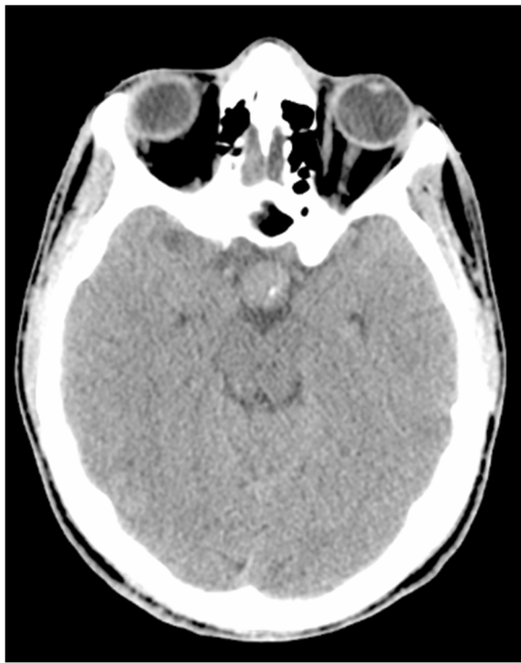
Figure 1 Cross-sectional computed tomography scan showing a pituitary mass.

pediatric cancers overall. Approximately 350 new cases are diagnosed in the US each year, and the annual incidence in children, adolescents, and young adults under the age of 20 is 4.3 cases per one million population [5]. Lung is the most frequent site of metastases from