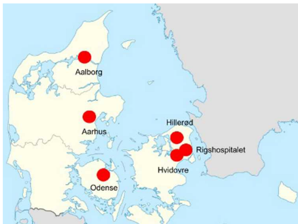
Figure 1 Geographical distribution of the involved departments of infectious diseases in Denmark.

During medical record review, the admission date of first-time hospitalization for COVID-19 was used as index date. If patients were tested positive for Severe acute respiratory syndrome Coronavirus 2 (SARS-CoV-2) while hospitalized for other reasons, the date of test for SARS-CoV-2 was considered the index date. Next, a local investigator reviewed the medical records of all hospitalized patients assigned a COVID-19 diagnosis code at each center including doctor’s notes, laboratory results, microbiological analyses, imaging results as described by the