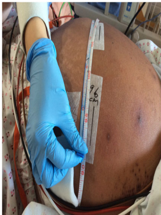
Figure 1 The young lady with idiopathic pulmonary arterial hypertension had advanced right heart failure with massive ascites and distended abdomen.

subcutaneous route without haemodynamic changes. In total, the patient removed 10 kg of fluid and reduced 20 cm of abdominal girth at the time of discharge. She was registered as a candidate for lung transplant 2 months later. However, she had clinical worsening presenting with an increase of ascites with distended abdomen again 6 months after the 1st index event. Transthoracic echocardiogram revealed patency of the right to left inter-atrial shunt but decrease in the atrial septostomy size to 0.4 cm in diameter. Again, we used 10 ng/kg/min aliquots shifts at 3 h intervals and spent 3 days to change the treprostinil from subcutaneous to IV route without haemodynamic changes. Then, we did 2nd session of BAS with a 6 mm balloon and reduced the mean RA pressure from 16 to 13 mmHg and arterial oximetry from 90% to 87%. She was discharged uneventfully after reducing 3 kg of extra fluid and 6 cm of abdominal girth. The 3rd session of BAS with a 7 mm balloon was done 1 month later. Moreover, we permanently transitioned the subcutaneous treprostinil to IV route via a peripherally inserted central catheter (PICC) 1 month after finishing three sessions of BAS. She is still alive with functional Class III symptoms 1 year after the 1st index event (December 2019).