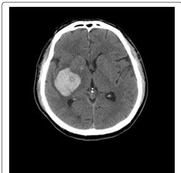
Figure 1 Right putaminal hemorrhage in a patient with post-stroke mania.

Projection data were acquired 30 minutes after an i.v. bolus injection of 740 MBq of ^{99m}\text{Tc} -ECD using a 3-headed rotating gamma camera (Toshiba GCA-9300A/DI; Toshiba Corporation, Tokyo, Japan) equipped with an ultra high-resolution fan beam collimator, and a medical image processor (GMS5500U/DI; Toshiba Corporation, Tokyo, Japan) was used image processing. The energy window for acquisition was set at 140 keV, with a width of 20%. The gamma camera was rotated continuously for 16 minutes, and SPECT data were arranged into 90 projection angles over 360 degrees. Images were reconstructed in a 128 x 128 matrix using a ramp filter after the data were processed with a Butterworth filter (order 8, 0.12 cycles/pixel). SPECT images were spatially normalized to standardized stereotactic space, smoothed using a 12-mm FWHM isotropic Gaussian kernel, and analyzed using the Easy Z-Score Imaging System (eZIS) [8]. Each SPECT image was compared with the mean and SD of SPECT images of 20 age-matched healthy male controls using voxel-by-voxel Z-score analysis after normalization to global mean voxel values; Z\text{-score} = ([\text{control mean}] - [\text{individual value}]) / (\text{control SD}) . The Z-score maps were displayed by projection with an averaged Z-score of 14-m thickness to a surface rendering of the anatomically standardized MRI template with a two-