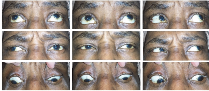
FIGURE 1: Left INO with absent left eye adduction. Exotropia and left skew deviation are present.