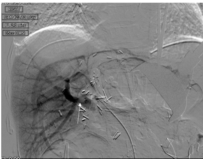
Fig. 2. Pre intervention direct portal venogram demonstrating a filling defect (white arrow) in the distal MPV compatible with a thrombus.