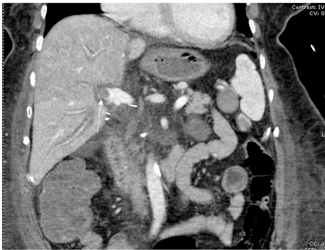
Fig. 1. CT venous phase demonstrating thrombus (white arrow) of the distal MPV.