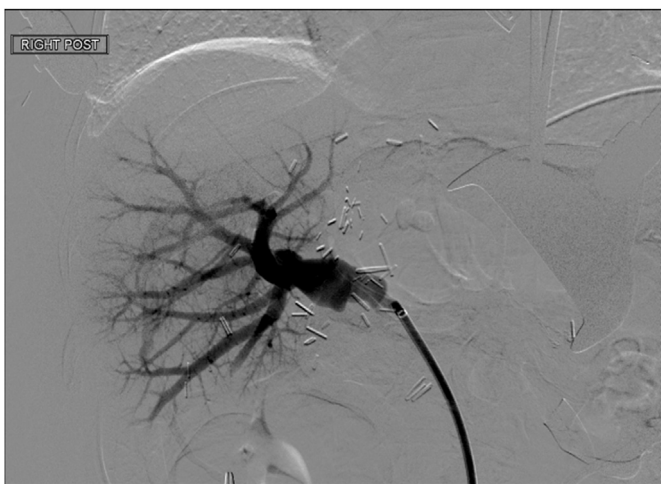
Fig. 3. Post thrombectomy direct portal venogram demonstrating resolution of the thrombus and patent portal veins.

demonstrating patency of the portal vasculature. Patient was discharged home eight days after thrombectomy procedure. Patient was maintained on Lovenox and Aspirin for 3 months after procedure. A contrast enhanced MRI obtained 8 months after transplant demonstrated patency of the portal venous system (Fig. 4). An US at this time demonstrated normal velocities without signs of liver decompensation.