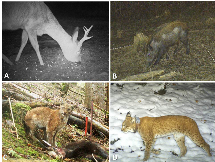
Figure 1 Detection of diseased animals by camera traps set by hunters and game wardens. A. Marked enlargement of the lower jaw in a roe deer (Picture: Martin Wyler). B. First detection of sarcoptic mange in a wild boar in Switzerland (Picture: Alex Hofer). Notice the extended alopecia on the ventral parts of the body. C. Eurasian lynx affected by sarcoptic mange (Picture: Pierre Jordan). The emaciation and shaggy fur are obvious. This animal was subsequently captured, marked and treated. D. Same lynx as on picture C , six months after treatment (Picture: Pierre Jordan).

Syndromes usually refer to incompletely defined diseases. Thus, syndromic surveillance uses the clinical, pathological or epidemiologic characteristics of disease occurrences to assess whether these are linked, instead of relying on the detection of etiologic agents or well-defined disease pictures. The number of cases with defined syndromes can be tracked in space or time [4,5]. Macroscopic findings were indeed shown to be valuable for identifying distinct pathological profiles among collected wild animal carcasses. Besides the potential usefulness for early outbreak detection, this classification system represents a tool for retrospective investigations [40]. In a study on roe deer ( Capreolus capreolus capreolus ) mortality in Switzerland, classifying data according to syndromes has proven useful for describing morbidity and morbidity causes, including analyses of cases of unclear etiology [41].