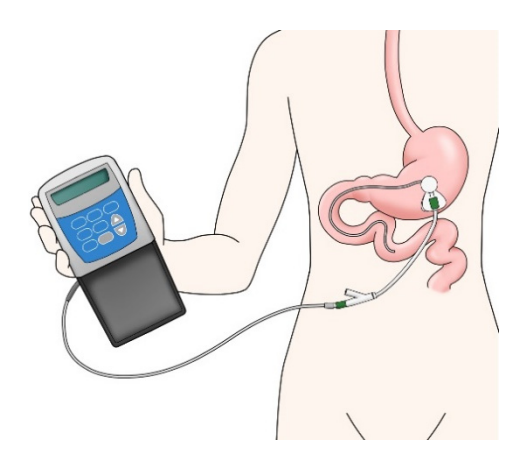
Figure 3. Levodopa-carbidopa intestinal gel (LCIG).