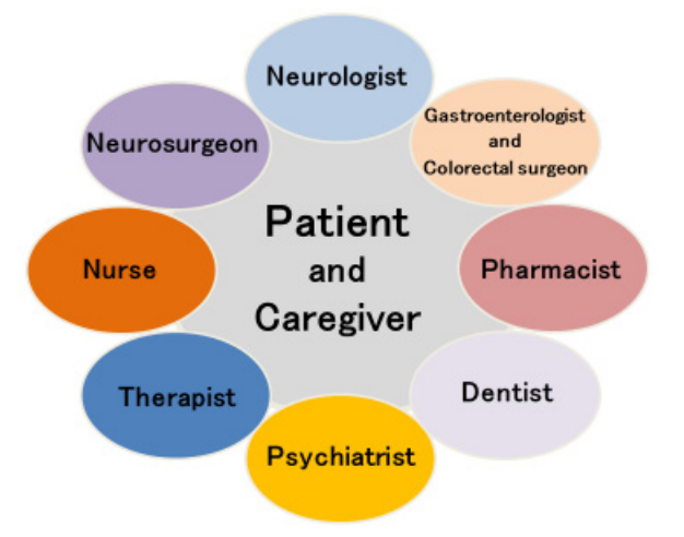
Figure 5. Team approach of advanced treatment for Parkinson's disease.

combination of multiple treatment modalities (e.g., unilateral DBS and contralateral RF lesioning). We consider that a team approach at an experienced center would maximize the benefit of tailor-made treatment effects in the application of surgical procedures.