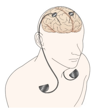
Figure 2. Deep brain stimulation (DBS).

reported effects are variable [25,26]. In Supplementary Table S2, we show the effects of DBS on individual symptoms for each target (STN, GPi, Vim, and PPN). Although there are currently only a few reports, the effects of targeting the post-subthalamic area, or caudal zona incerta (PSA/cZi) are also expected to be positive [27]. Motor features of PD are bilateral in most cases and often have a right/left side dominance. The effectiveness of unilateral STN and GPi-DBS has also been reported [28,29], indicating that unilateral DBS may be an option, especially in cases with a strong left/right dominance. Furthermore, stepped GPi and STN-DBS, which is initially unilateral and then contralateral, or combined unilateral STN and contralateral GPi DBS may offer an effective resolution for certain PD patients [30,31]. It is also noteworthy that the connectomic approach has addressed the identification of stimulation targets in individual cases [32,33], and this technological advancement may also contribute to personalized DBS.