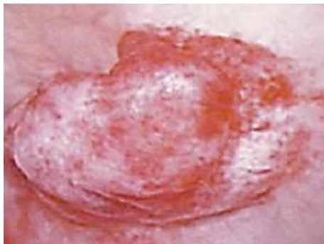
Fig. 2. Image obtained by cystoscopy.