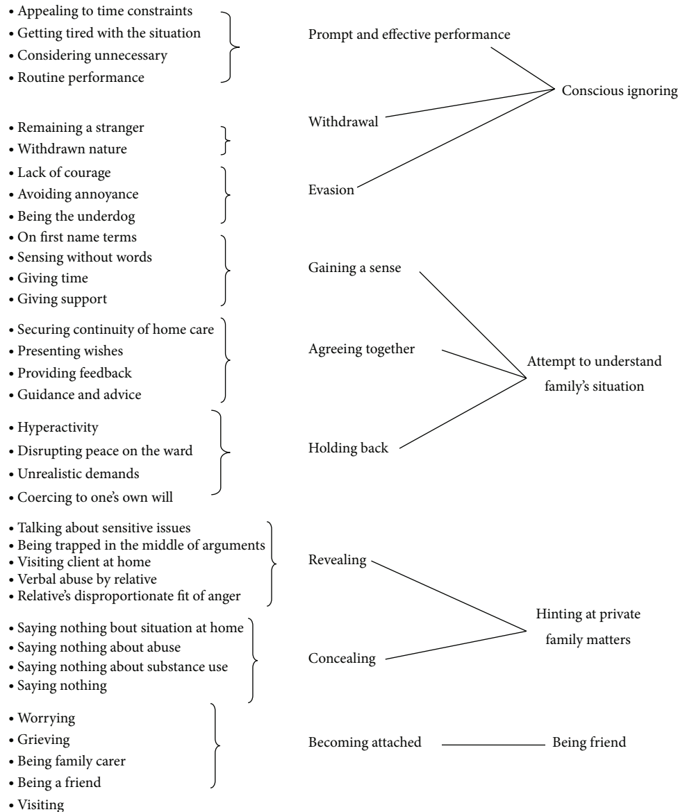
FIGURE 2: Collaborative relationship between nurse and family carer in respite care for elderly patients.

would manage. According to the interviewees carers did not expect their problems to be resolved; all they wanted was someone they could trust and who would listen to them and encourage them. Hinting at private family matters required a collaborative relationship based on mutual trust, the foundations for which were created upon admission to respite care.