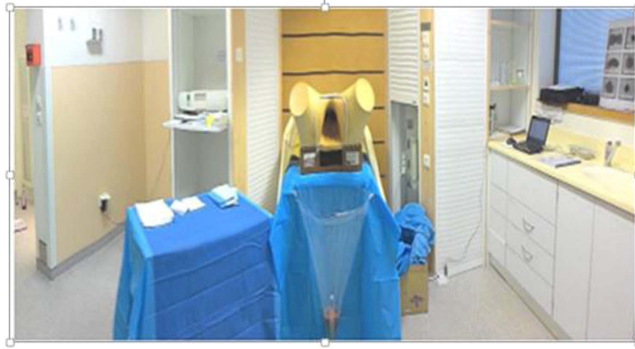
Figure 1. Scenario which recreated a vaginal delivery during the training session.

The French College of Gynecologists and Obstetricians (CNGOF) 4 recommends the use of a collector bag only once the PPH diagnosis is established.