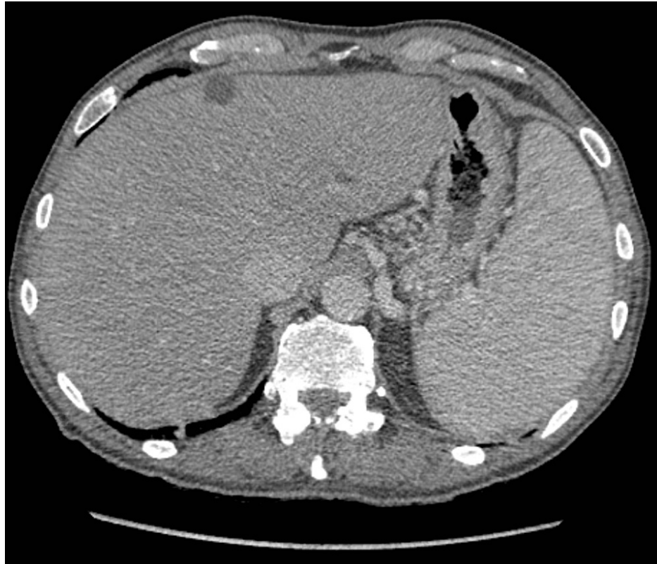
FIGURE 3: Case two: computed tomography of the abdomen and pelvis.

Findings compatible with portal venous hypertension including splenomegaly and multiple collaterals.