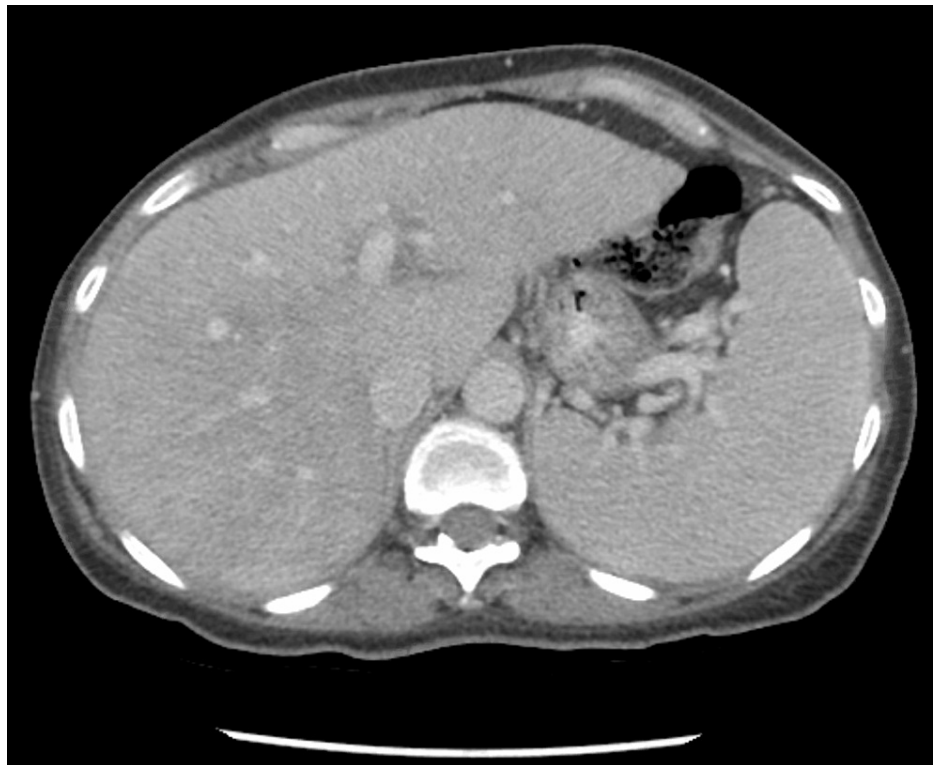
FIGURE 1: Case one: computed tomography of the abdomen and pelvis.

Findings compatible with cirrhotic liver with secondary features of portal hypertension such as splenomegaly, dilated portal and splenic veins, and minimal ascites