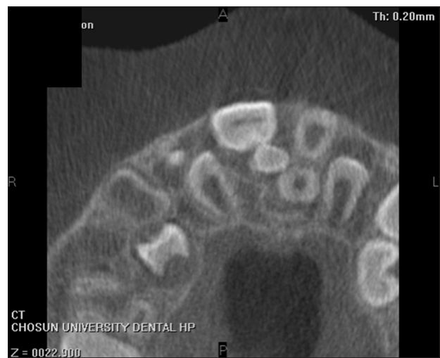
Fig. 4. A mesiodens impacted on the palatal side of the central incisor. Sung-Suk Lee et al: A comparative analysis of patients with mesiodens: a clinical and radiological study. J Korean Assoc Oral Maxillofac Surg 2015