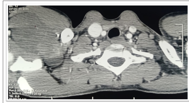
Figure 3. Thoracic CT: showing a well-defined under right clavicle mass extended to the axillary region. The mass size was 7 × 5 cm. CT, computed tomography.

We performed surgical resection. On surgical exploration, large mass was identified immediately on retropectoral. The mass was strongly adhered to several branches of the brachial plexus.