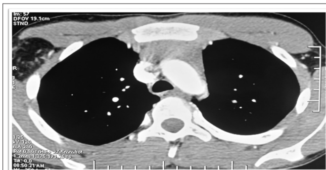
Figure 2. Thoracic CT: showing a well-defined under right clavicle mass extended to the axillary region. The mass size was 7 × 5 cm. CT, computed tomography.