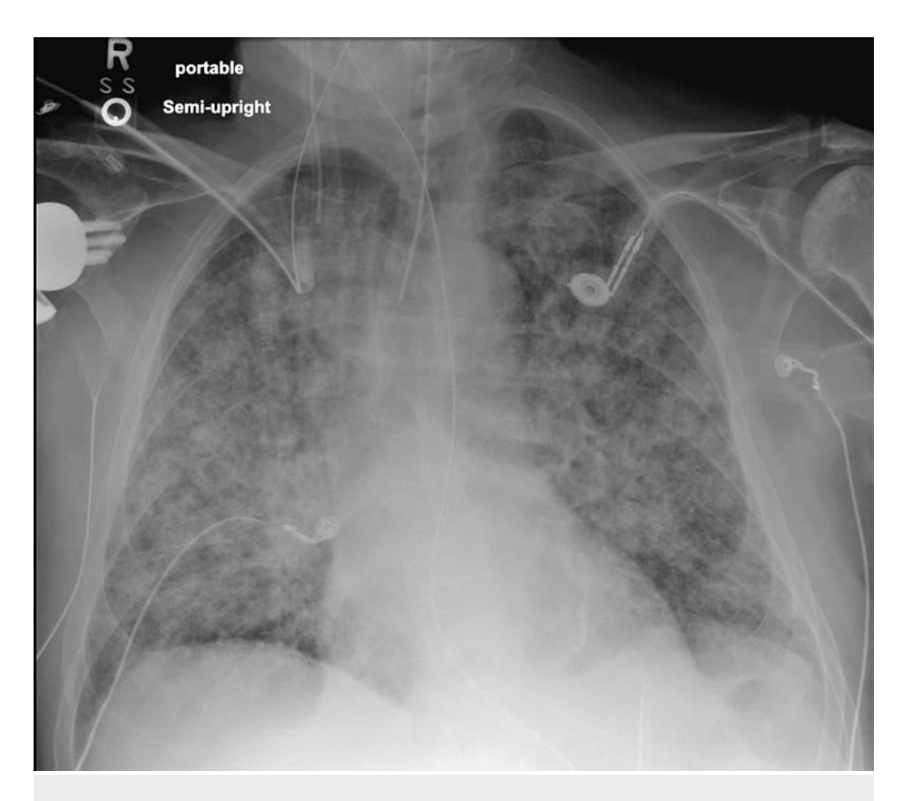
FIGURE 2: Chest x-ray showing diffuse bilateral pulmonary opacities suggesting the development of ARDS

ARDS: acute respiratory distress syndrome