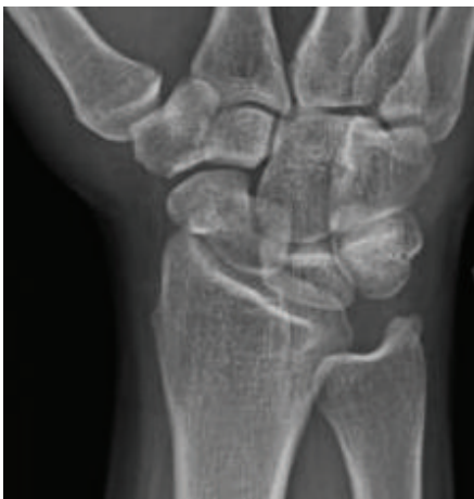
FIGURE 6: An oblique radiographic view obtained 6 weeks after presentation with no radiographic abnormality of the scaphoid.

has been utilized to diagnose or confirm scaphoid stress fractures [6, 7, 11, 13, 15, 16]. Several patients with negative presenting radiographs had the fracture only later diagnosed on repeat radiographs or advanced imaging [2, 3, 6]. In the case presented here, the presenting radiographs were negative, and an MRI was essential for making the diagnosis.