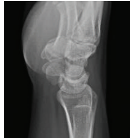
FIGURE 7: A lateral radiographic view obtained at 6 weeks after initial presentation showing a normal appearing scaphoid.