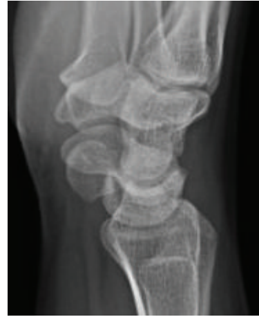
FIGURE 3: A lateral view of the wrist at the time of initial evaluation without radiographic abnormality of the scaphoid.

Scaphoid stress fractures are very rare injuries, with only case reports available for analysis in the peer-reviewed literature. In each reported case, the patients were competitive, high-level athletes training for multiple hours per day for several years prior to their presentation (Table 1). While gymnasts have been the athletes most commonly affected [2–7], others have also experienced these rare injuries: divers, soccer