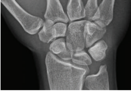
FIGURE 1: Posteroanterior radiographic view of the wrist at the time of initial evaluation that shows no abnormality in the scaphoid.