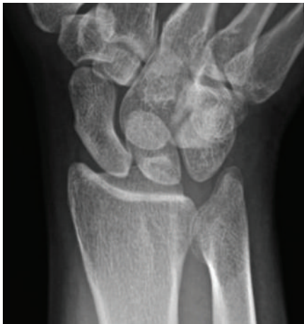
FIGURE 5: A scaphoid view obtained 6 weeks after presentation without radiographic evidence of a scaphoid waist fracture.