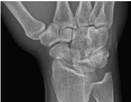
FIGURE 2: An oblique radiographic view at the time of initial evaluation without evidence of abnormality of the scaphoid.

fracture at the scaphoid waist with associated bone edema and no cortical breakthrough, best seen on the T2 sagittal cut (Figure 4).