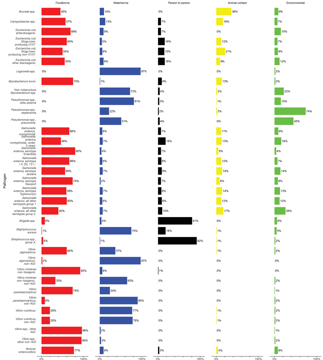
Figure 2. Source attribution results for major transmission pathways of bacteria in study of attribution of illnesses transmitted by food and water to comprehensive transmission pathways using structured expert judgment, United States, 2017.

represent scenarios at the boundaries among different transmission pathways. For 17 (85%) questions, >75% of participants answered with the correct major pathway, and of these questions, 13 (76%) were answered with the correct subpathway as well (Appendix 4).