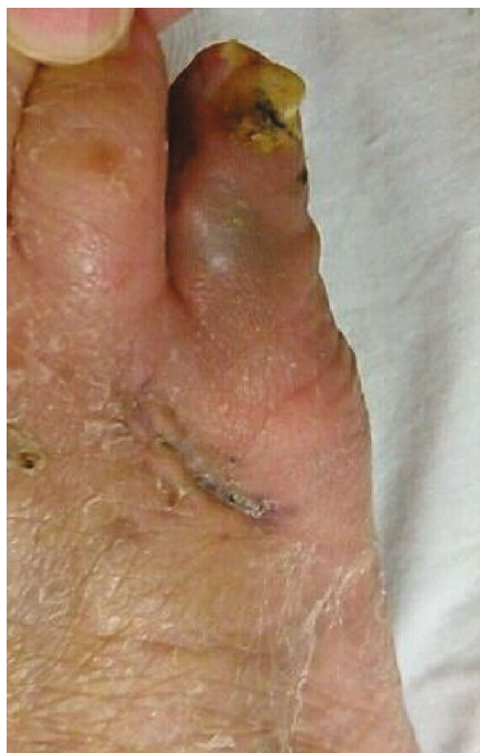
FIGURE 3: Postoperative macroscopic findings of the right foot, showing complete resolution of the ulcer.

with intractable foot ulcers. In our case, we did not proceed with wound debridement owing to the persistent local pressure on the skin due to the overlap between the 4 th and 5 th digits. Amputation of the 5 th digit was considered a possible solution to eliminate the local pressure but was not deemed as an appropriate treatment due to issues of ethics and cosmesis. Alternately, we proceeded with the correction of the hallux valgus deformity and correction of the alignment of the forefoot as a strategy to eliminate the abnormal pressure on the dorsum of the 5 th digit, thus allowing for the healing of the ulcer and possible improvement in activities of daily living. Postsurgery, the ulcer healed with no recurrence of infection. Furthermore, foot cosmesis was improved, and the patient could stand independently for transfers from her wheelchair.