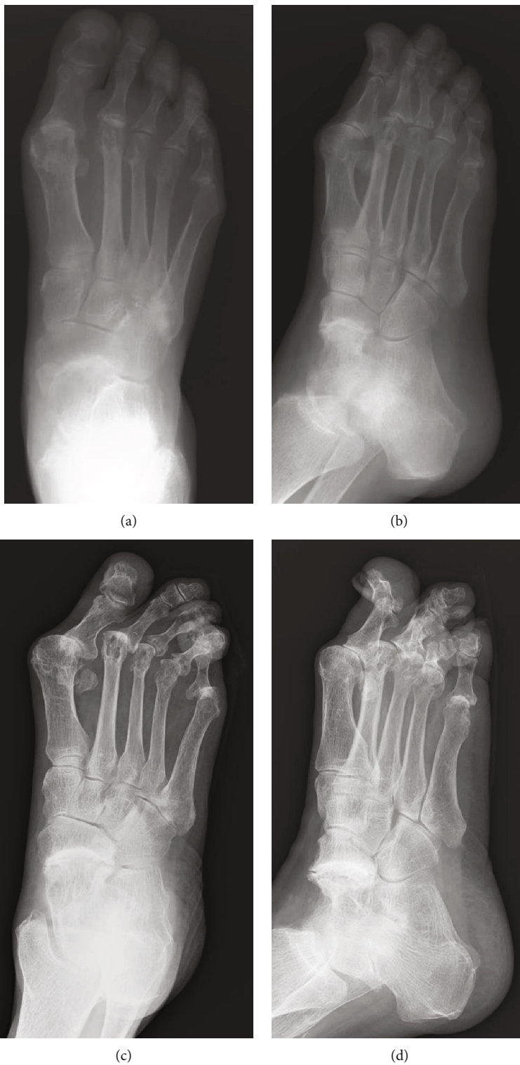
FIGURE 1: Continued.