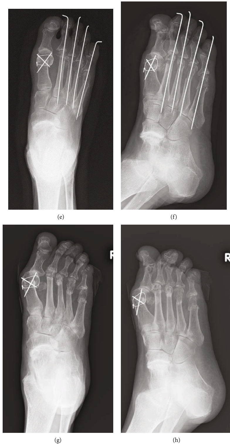
FIGURE 1: Time course of radiographs of the right foot. At 61 years old, X-ray shows that the hallux valgus angle (HVA) is 29^\circ , the interphalangeal angle between the first and second metatarsals ( M_1M_2A ) is 9^\circ , and the interphalangeal angle between the first and fifth metatarsals ( M_1M_5A ) is 30^\circ (a; anteroposterior view) (b; oblique view). Just before surgery at 76 years old, HVA is 50^\circ , M_1M_2A is 15^\circ , and M_1M_5A is 35^\circ , respectively (c; anteroposterior view) (d; oblique view). Mitchell's osteotomy for hallux and shortening oblique osteotomies for lesser toes were performed. Postoperative radiographs show that HVA is 19^\circ , M_1M_2A is 7^\circ , and M_1M_5A is 23^\circ , respectively (e; anteroposterior view) (f; oblique view). Recent follow-up radiographs at 6 months after the surgery show that temporal Kirschner wires for lesser toes are removed and that each osteotomy site healed (g; anteroposterior view) (h; oblique view).