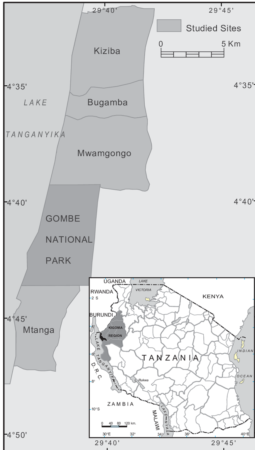
Fig 1. Map of the study area, showing the arrangement of villages sampled in relation to Gombe National Park. The inset shows the location of the study area within Tanzania.

https://doi.org/10.1371/journal.pntd.0005937.g001