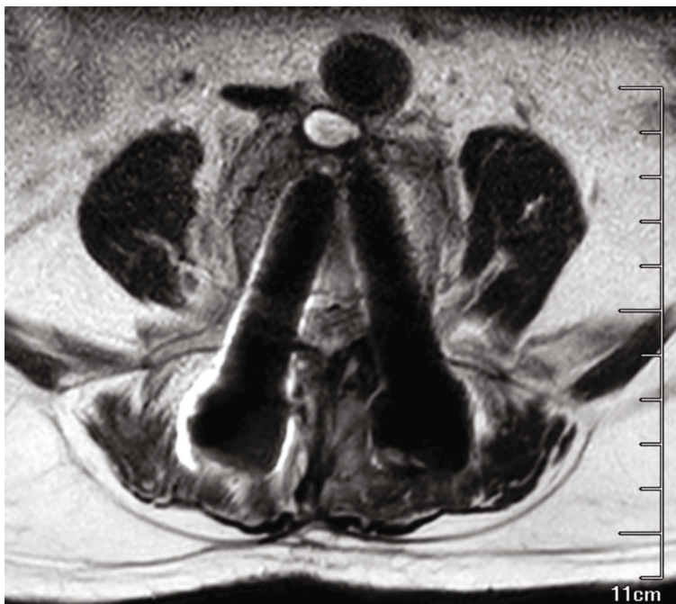
FIGURE 2: Preoperative MRI of the fourth and fifth lumbar spine.