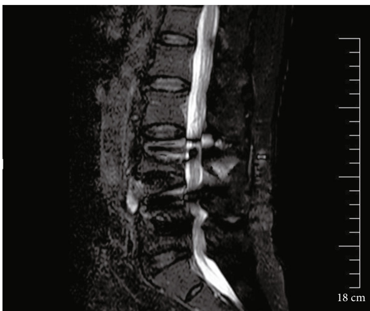
FIGURE 3: Preoperative MRI of the fourth and fifth lumbar spine.

patient was an elderly diabetic patient with long-term pain in both lower limbs after the operation. Imaging manifestations of fungal infections are obtained. Postoperative fungemia is closely associated with the patient's advanced age and diabetes [6, 7]. The study by Quindós [8] showed that mycelia in the elderly lack typical symptoms of bacteremia. Most of the symptoms of systemic poisoning in osteomyelitis are mild and local acute inflammation comes slowly, such as