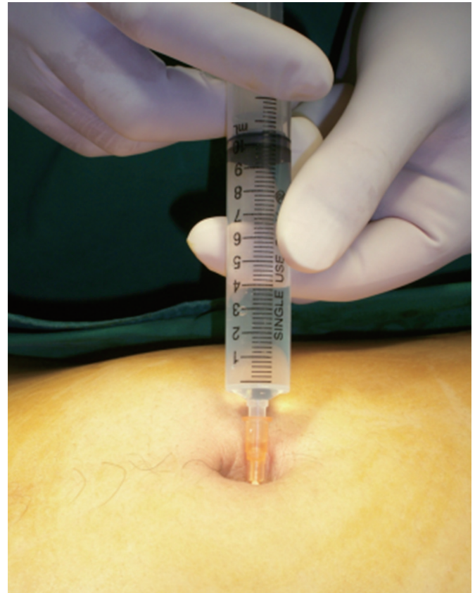
Fig. 1. Wound infiltration with 10 mg of 0.5% bupivacaine around the umbilicus just before incision.

In all patients, a patient-controlled analgesia (Accufusor, WooYoung Medical, Seoul, Korea) was used. As the patient-controlled analgesia, 18 µg/kg of fentanyl and 3 mg/kg of Keromin (Ketorolac Tromethamine) were diluted with metoclopramide and saline