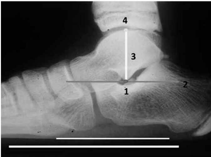
Figure 3 – Illustration of measurement of talar height (explained in text).