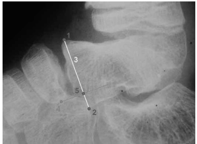
Figure 5 – Illustration of calculation of degree of navicular subluxation (explained in text).