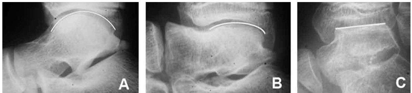
Figure 1 – Talar sphericity patterns: (A) normal, enabling good mobility of the joint; (B) slightly flattened; (C) greatly altered or flat.

The height and length were measured in the affected foot and the contralateral foot. A simple percentage