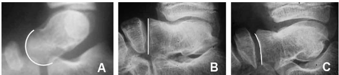
Figure 2 – Sphericity patterns for the talonavicular joint: talar head (A) convex; (B) planar; (C) concave.