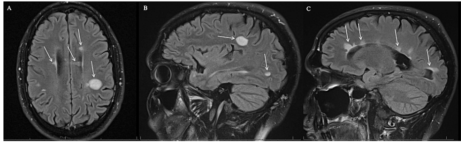
FIGURE 2: (A-C): MRI brain with and without contrast. Figure 2A showed significantly decreased vasogenic edema associated with the previously described left parietal lobe white matter lesion. Additional supratentorial white matter lesions consistent with MS are again appreciated and not significantly changed. Figures 2B and 2C showed two sagittal views of the decreased vasogenic edema associated with the previously described left parietal lobe white matter lesion. Additional supratentorial and infratentorial white matter lesions consistent with MS are again appreciated and not significantly changed.

After following up with neurology, the patient would be treated with immunomodulators; however, the patient tested positive for hepatitis B prior to treatment. Although no liver damage was detected, the patient was recommended to follow up with the hepatologist and withhold treatment with immunomodulators until a further clinical assessment is completed.