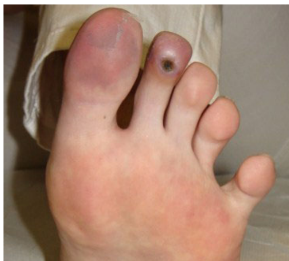
Figure 1 Ulcer as it appears after 5 sessions of HBO.

patient, blood tests were normal and there have been no new flares of the disease so far.