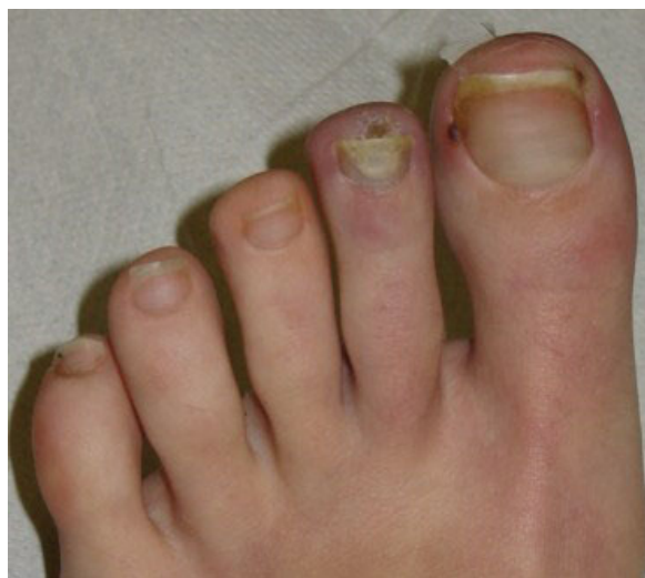
Figure 2 Toes as they appear after 5 sessions of HBO.

Vasculitic skin ulcers are a manifestation of muscular-vessel vasculitis, and are very painful and difficult to manage. They are usually treated by medical therapy with systemic anti-inflammatory drugs, steroids and immunosuppressants. For the treatment of refractory vasculitic skin ulcers the use of prednisone combined with other drugs such as methotrexate, azathioprine, mycophenolate mofetil, cyclophosphamide or hydroxychloroquine is recommended. Even the administration