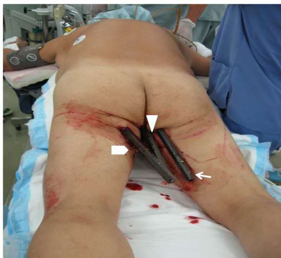
Figure 1 Patient impaled with three steel bars: bar A ( \Delta ; patient's left side), bar B ( \Delta ; center) and bar C ( \uparrow ; right).

With our patient under general anesthesia and in the lithotomy position, bars A and B were gently pulled and successfully removed. Next, a celiotomy was performed to remove bar C. Following the removal of bar C, bleeding from the anterior side of his sacral bone was controlled by gauze packing. The perineal wound was debrided and pre-sacral drainage was performed. The total volume of intraoperative bleeding was 4000mL, and 12 units of red cell concentrate and six units of fresh frozen plasma were transfused. Imipenem/cilastatin and clindamycin were preoperatively administered. After the surgery, our patient