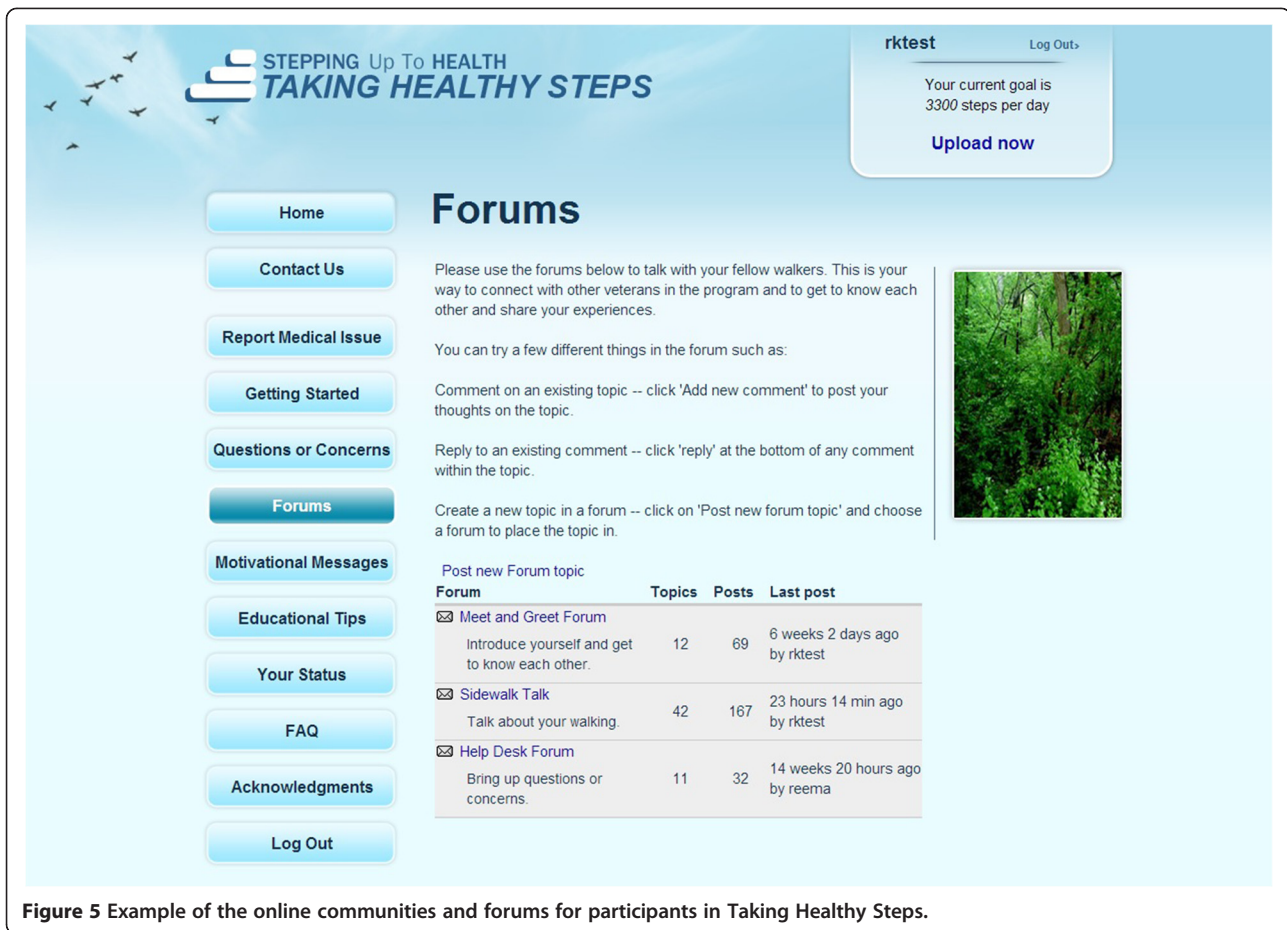
Figure 5 Example of the online communities and forums for participants in Taking Healthy Steps.

clinical trials of pulmonary rehabilitation, disease management interventions, and exercise [49] in patients with COPD. SGRQ will be measured at baseline, four months, and one year after randomization.