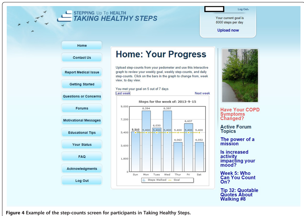
Figure 4 Example of the step-counts screen for participants in Taking Healthy Steps.

The primary outcome is change in Saint George's Respiratory Questionnaire (SGRQ) Total Score at 4 and 12 months compared to baseline. The SGRQ is a well validated disease-specific HRQL measure [48] widely used in