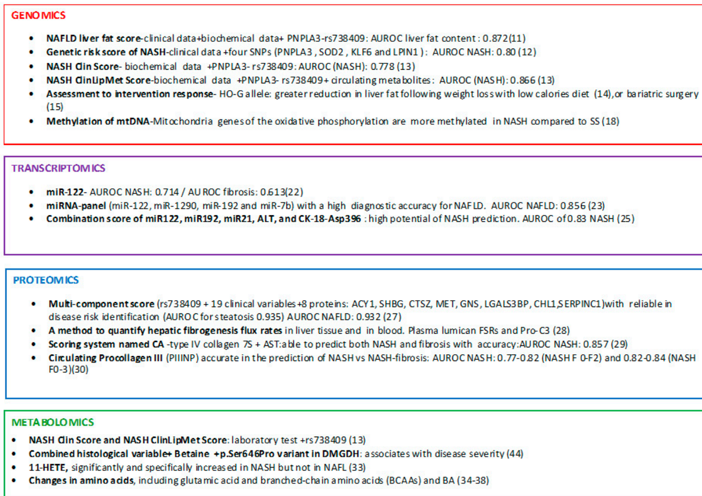
Figure 2. OMICS signatures/biomarkers and NAFLD severity.