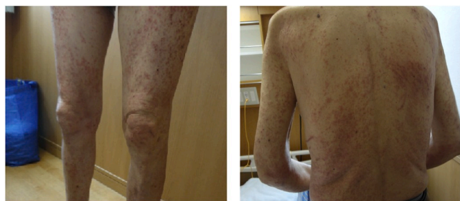
Fig. 2. Skin eruptions findings. Red eruptions that were itchy appeared on his face, limbs, and trunk. (For interpretation of the references to colour in this figure legend, the reader is referred to the Web version of this article).

Idiopathic thrombocytopenia (ITP) is an autoimmune disorder caused by the formation of antibodies targeting platelet antigens, leading to thrombocytopenia. It has been termed primary immune thrombocytopenia recently and represents various hemorrhagic symptoms. Erythrocytes and leukocytes normally do not show any abnormalities, and the production of megakaryocytes in bone marrow is normal. ITP is mainly a disorder of exclusion; underlying thrombocytopenic diseases,