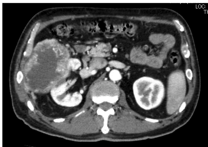
Fig. 1. The abdominal computed tomography findings. The computed tomography showed a 11.2 × 8.2 × 7.0 cm right renal enhanced mass. The patient was diagnosed with right renal cell carcinoma (cT3aN0M0).

the lower limbs, which were biopsied (Fig. 2). His eruption improved immediately with the use of steroids. The biopsy of the skin eruption revealed that the upper layer of the dermis was edematous, and lymphocytes and eosinophils invaded the stroma. Hence, we diagnosed the patient with nivolumab-induced skin eruptions. Intravenous prednisolone was switched to oral administration; on day 20 after methylprednisolone administration, the patient's platelet count decreased to 24 \times 10^3/\mu\text{l} . We suspected irAE, performed a bone marrow biopsy, and increased prednisolone to 50 mg/day again. However, the following day, his platelet count decreased to 17 \times 10^3/\mu\text{l} , and platelet transfusion was performed the same day. The platelet counts continued to be low for a prolonged time. Hence, on day 33 after methylprednisolone administration, dexamethasone pulse therapy, a thrombopoietin receptor agonist, and IVIG were administered, but to no effect. A platelet transfusion of 90 units was provided throughout the treatment period. There were no hemorrhagic symptoms and the platelet-associated IgG (PA-IgG) level slightly elevated to 73 \text{ ng}/10^7 \text{ cells} . The metastatic lesions were gradually enlarged, and by day 56 after methylprednisolone administration, the patient died (Fig. 3).