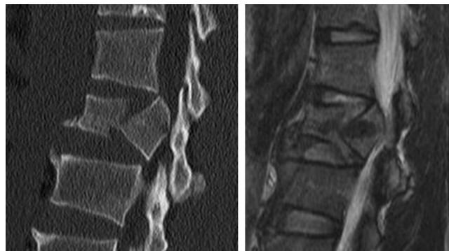
Figure 2 - 34-year-old man with an A3.1 fracture at level L2. T 2 WI magnetic resonance image shows that the upper intervertebral disc is injured at a Grade 3 level and that the lower disc is a Grade 1 injury.

The intervertebral disc is a part of the passive stabilizing subsystem of the spine. Both damage and degeneration of