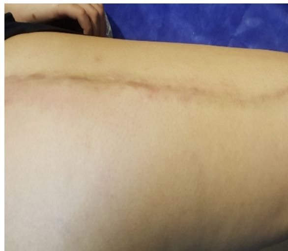
Fig. 1. The postoperative scar after right THA

Physical examination showed that both surgical areas