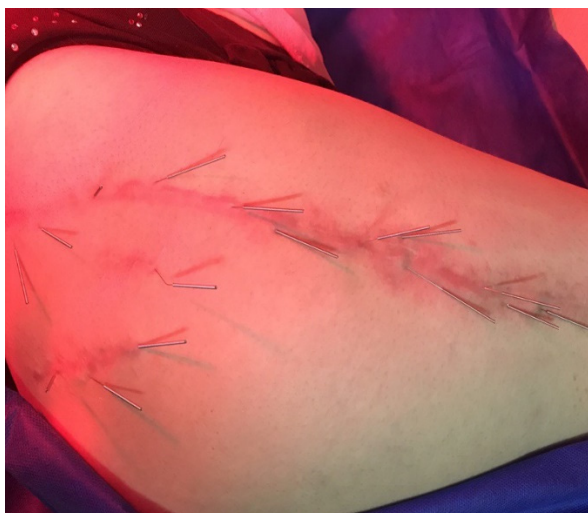
Fig. 2. DN of the scar in the right hip

adhesion. The therapist placed other needles (0.25 x 25 mm, Dong Bang Acupuncture Inc., Kyunggi-do, Korea) above the proximal border of the scar band at a 15 to 30 degrees perpendicular to the tissue surface in a vertical line and gently rotated the needles back and forth. In addition, infrared radiation was applied for 20 minutes at a distance of 40 cm from the patient's body to improve regeneration and facilitate scar tissue regeneration (Fig. 2). Needles were manipulated and rotated 2–3 times during the session. Treatments were performed twice a week for 3 continuous weeks with 30 minutes each time.