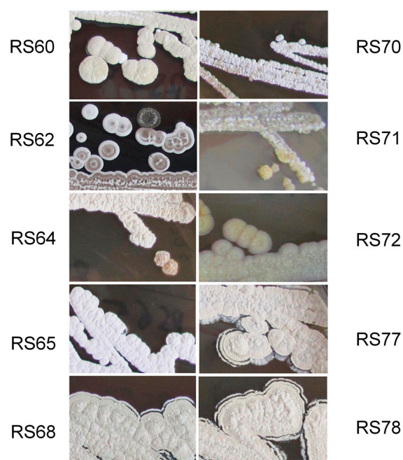
Figure 1. Morphology of the actinomycetes selected for molecular identification. The selected strains for molecular identification were isolated from intestine (RS60 and RS62) and from feces (RS64, RS65, RS68, RS70, RS71, RS72, RS77 and RS78). A portion of 3 cm of a normal petri dish is shown in each panel. The cultures were carried out on R2YE and incubated at 28 °C for 8 days.