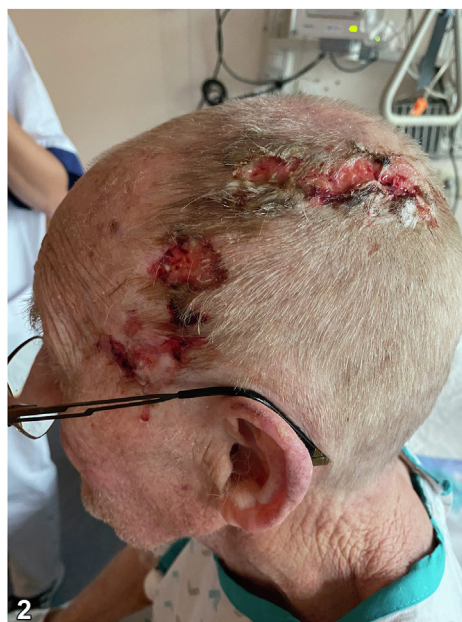
Frontal branch temporal artery