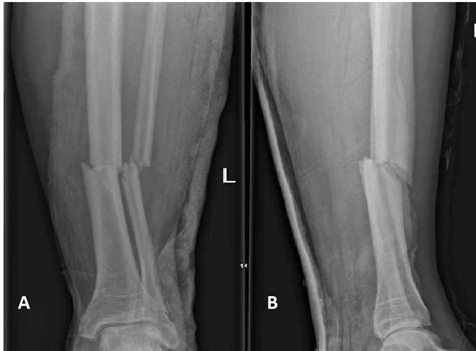
FIGURE 2: Anteroposterior (A) and lateral (B) radiographs of one of the cases in this study with a tibia/fibula fracture on presentation

Exogen as well as other recently published studies, whose success rates vary between 78% and 90% [10,13-15]. An example of one of the successfully managed patients with LIPUS therapy can be appreciated in Figures 2-5. It is important to recognise that two recently performed retrospective reviews reported worse union rates with the lowest reporting a success rate of 47% [4,11,12].