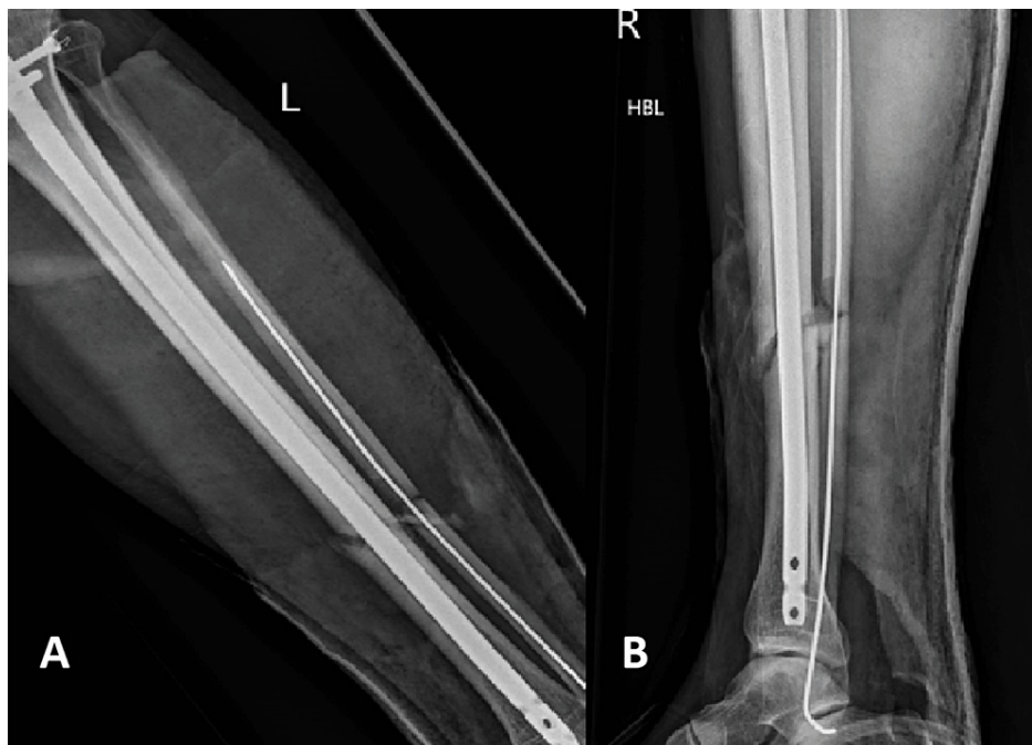
FIGURE 3: Anteroposterior (A) and lateral (B) radiographs of a tibia/fibula fracture after intramedullary nailing