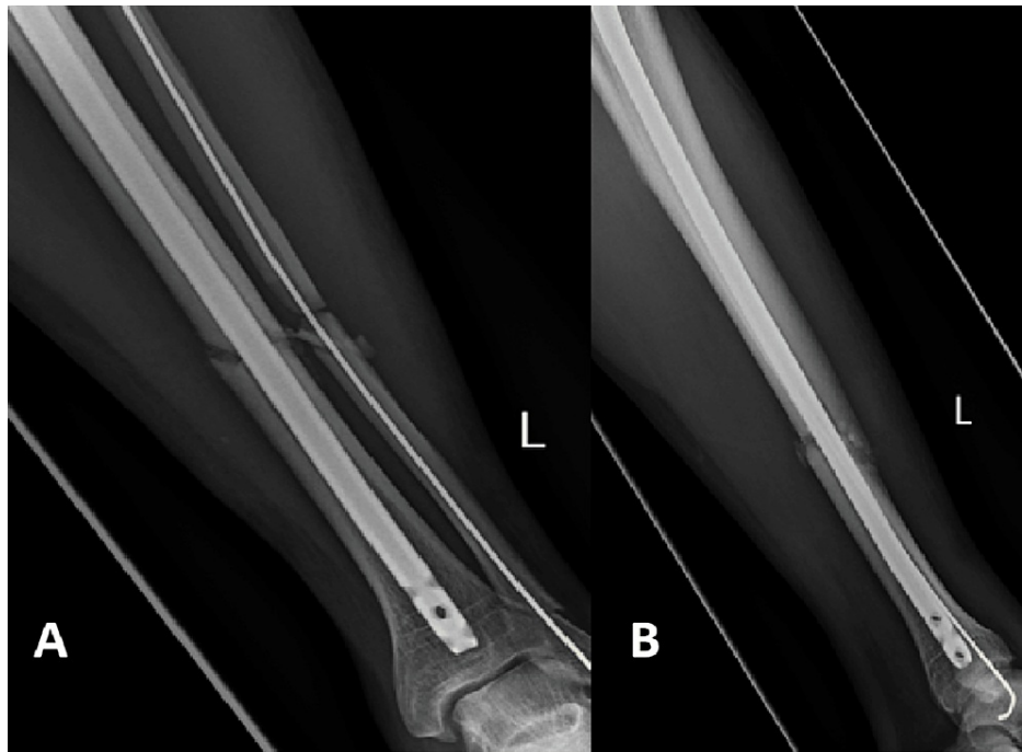
FIGURE 4: Anteroposterior (A) and lateral (B) radiographs of a tibia/fibula fracture after three months with radiological features of delayed union