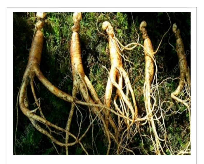
FIGURE 1 The photo of Ginseng. The photo of Ginseng collected from Jilin province, one of major production regions of Ginseng in China.

Panax ginseng C.A.Mey. has been widely consumed as food/ diet supplements from natural sources, and its therapeutic properties have also aroused widespread concern (Figure 1) (Fan et al., 2020a). Therapeutic properties of Panax ginseng C.A.Mey. such as anti-inflammatory, altering the composition and metabolism of the microbiota, ameliorating chronic inflammation, enhancing the immunity, resisting the oxidation again, and regulating the glucose and lipid metabolism have been widely reported (Cao et al., 2019; Jang et al., 2019; Liu et al., 2019, 2020; Xue et al., 2019; Huang et al., 2020; Quan et al., 2020; Xu et al., 2020). Intriguing new data suggest that Panax ginseng C.A.Mey. could minimize renal injury by inhibiting oxidative inflammatory responses, epithelial-mesenchymal stress, transition, and fibrosis (Liu et al., 2020; Shi et al., 2020; Xie et al., 2020; Zhu et al., 2020; Li et al., 2021). This finding is pertinent to the pathologic phenotype of KD, which is characterized by features of destruction of the glomerular