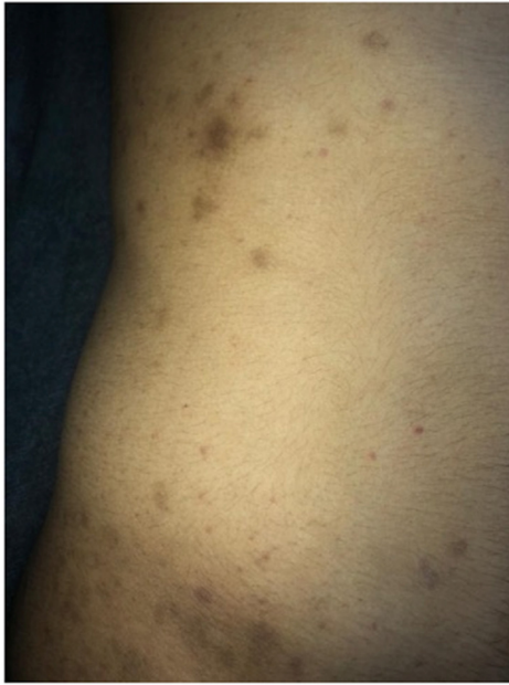
Fig 1. Multiple erythematous scaly papules admixed with postinflammatory hyperpigmentation.