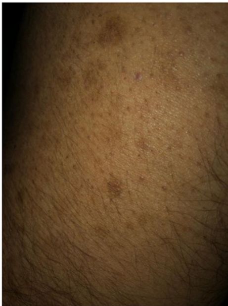
Fig 2. Solitary erythematous papules with multiple postinflammatory hyperpigmentation.

Mucha-Habermann disease induced by a freeze-dried live attenuated measles vaccine. 12 Thereafter, several cases have been reported during the past decade regarding the possible association between vaccination and pityriasis lichenoides infection. To date, 12 cases have been reported in the literature linking different types of vaccines with pityriasis lichenoides (Table 1). The most frequent vaccine types associated