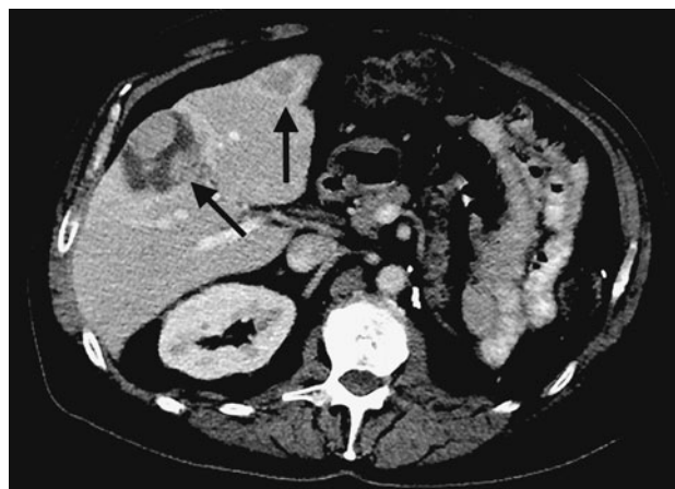
Fig. 2 Scan shows decrease in size and necrosis of hepatic masses on the follow-up study 30 months later ( arrows )

Toxicities during the early course of treatment included grade 1 rash, fatigue, stomatitis, and ankle swelling.