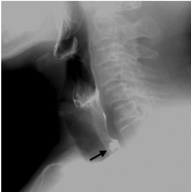
FIGURE 2 Barium swallow study depicted a left barium-filled sac protruding from the left anterolateral wall of the cervical esophagus (black arrow)

Killian-Jamieson diverticulum represents a rare entity, originating on the anterolateral wall of the cervical esophagus, below the cricopharyngeal muscle. This diagnosis should be considered when a thyroid nodule is located near the esophagus, especially when it ultrasound features changes after swallowing. 1