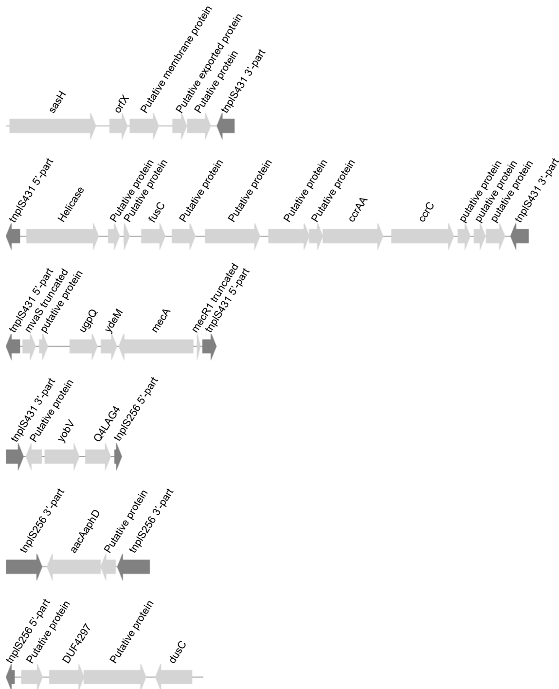
Figure 1 CC15-MRSA SCC element.

Notes: Six contigs related to the SCC element (MF185204 to MF185209). The first contig comprises the flanking orfX gene, and the last contig the flanking dusC gene. In between, four contigs are shown carrying genes typically found in SCC elements. Contig 2 has the fusidic acid resistance gene fusC and the SCC recombinase genes ccrAA and ccrC . Contig 3 comprises the mecA gene cluster with mecR1 truncated by tnpIS431 . Contig 5 constitutes a true insertion element, where the bifunctional kanamycin resistance determinant aacAaphD is flanked by two copies of tnpIS256 .