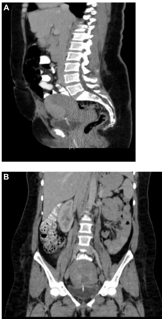
Figure 1. (A, B) The CT demonstrated a fistula between the dome of the bladder and the endometrial cavity (ureterovesical fistula). No signs of urinoma as or ureteric injury.

in the fourth day post-op the patient discharged from the hospital with orally antibiotic and appointment after 1 week to do cystogramme test (Fig. 3).