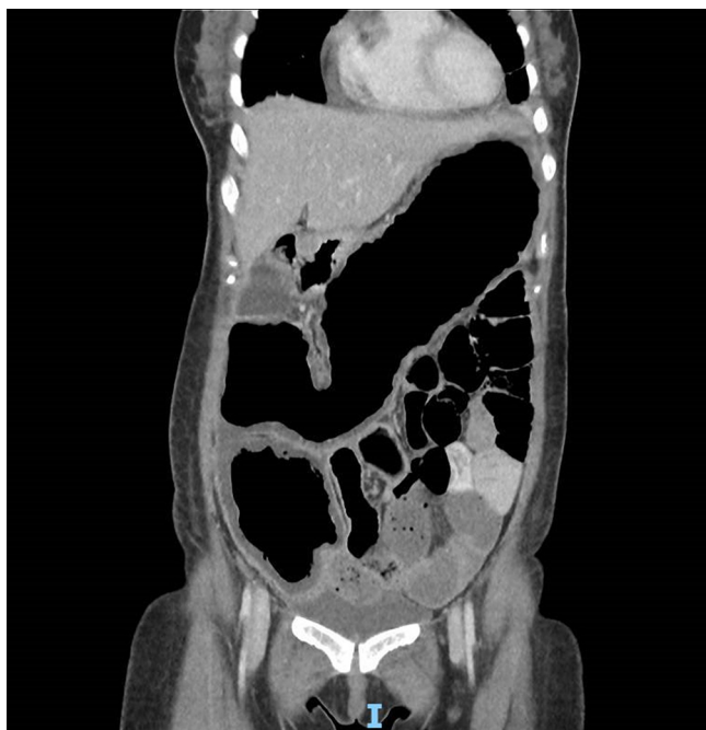
Fig. 1. CT scan of dilated colon.

An emergent laparotomy performed revealed grossly dilated colon with numerous areas of ulceration and perforation resulting in faeculent peritonitis. A total colectomy was performed and during the transection of small bowel, segments of an adult tapeworm was retrieved (Fig. 5). As she was haemodynamically unstable on dual vasopressors with areas of small bowel ischaemia, decision was made for temporary abdominal closure. She subsequently underwent a relook laparotomy where a 2nd adult tapeworm was retrieved. As her rectal mucosa was ulcerated, an end ileostomy was formed.