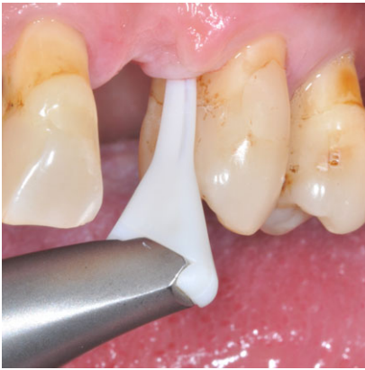
Fig. 2. Subgingival air-polishing in a residual pocket, using a special nozzle (test).

list. At baseline, month 3, 6 and 9, each site with PD >4 mm was treated.