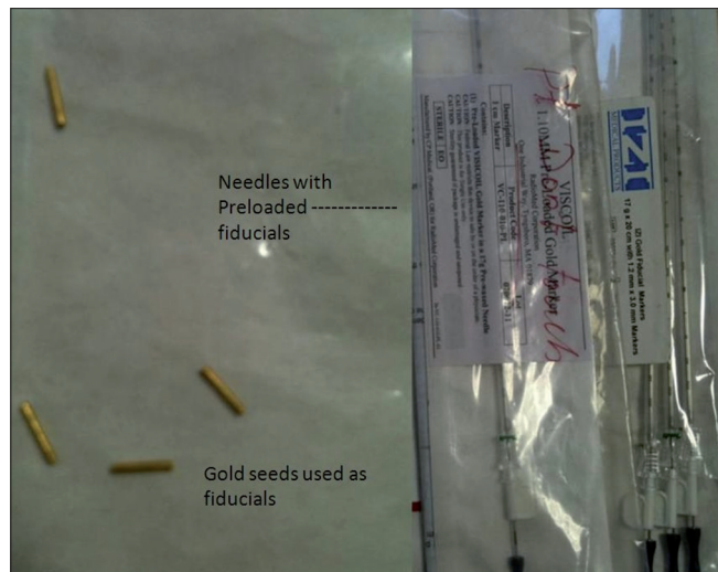
Figure 1: Photograph of free gold seeds and the introducers

As in all percutaneous procedures, preparation starts