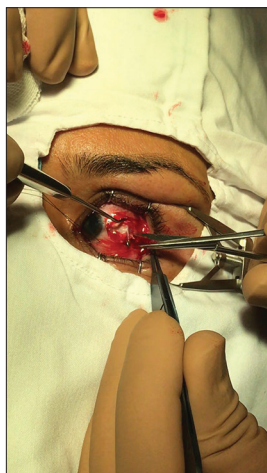
Figure 2: Marginal myotomy of the lateral rectus. A resection clamp is placed across the muscle about 4 mm from its insertion

The present study had two groups each with 14 eyes from 14 patients who underwent strabismus surgery. A total of 28 cases were successfully treated and completed the course of the study. The mean \pm SD age was 18.3 \pm 12.0 and 18.4 \pm 11.3 years in the MRR/MM group and MRR group, respectively ( P > 0.05 ). All patients had unilateral recession [Table 1]. There was no statistically significant baseline difference between the two groups in terms of PFW ( P > 0.05 ), AHP ( P > 0.05 ) and up/downshoot ( P > 0.05 ). The difference in preoperative ocular deviation in the primary position of gaze was not statistically significant in