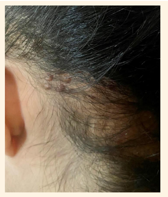
Figure 3: Photograph of the left temporo-occipital region showing significant resolution of angiolymphoid hyperplasia with eosinophilia lesions following 7 weeks of treatment using cryotherapy and topical metronidazole.

Currently, the aetiology and pathogenesis of ALHE are not fully understood. The commonly accepted