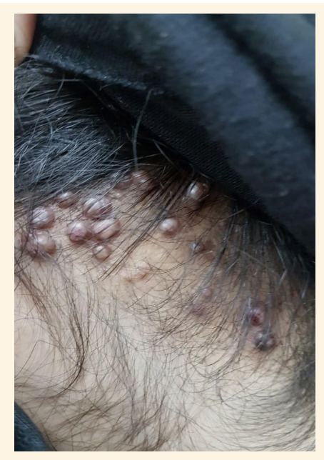
Figure 1: Photograph of the left temporo-occipital region showing multiple erythematous papules and nodules (angiolymphoid hyperplasia with eosinophilia lesions before treatment).

usually localised to the head and neck, mainly in the periauricular region; however, it has rarely been reported to affect other parts of the body, such as the colon, hands, penis and oral mucosa.<sup>5,6</sup> Overall, ALHE can be asymptomatic but may also present with spontaneous bleeding, itchiness or pain.2