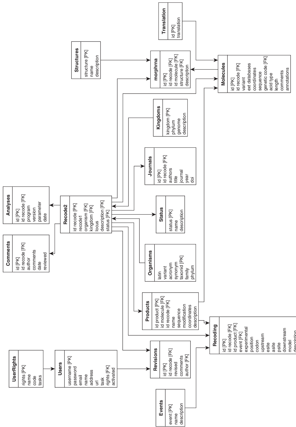
Figure 1. Entity-Relationship diagram for the Recode-2 database. The database schematic shows the relationships between the database tables. Each Recode-2 entry is composed of one entry in the Recode-2 table and a variable number of entries in related tables. PK (Primary Key) indicates the row selected as the unique identifier for a table. FK (Foreign Key) indicates rows of a table whose values match those in the primary key of a related table. (This ensures the constancy of the database.) The arrows show the connection relationships between the various tables (PK to FK).