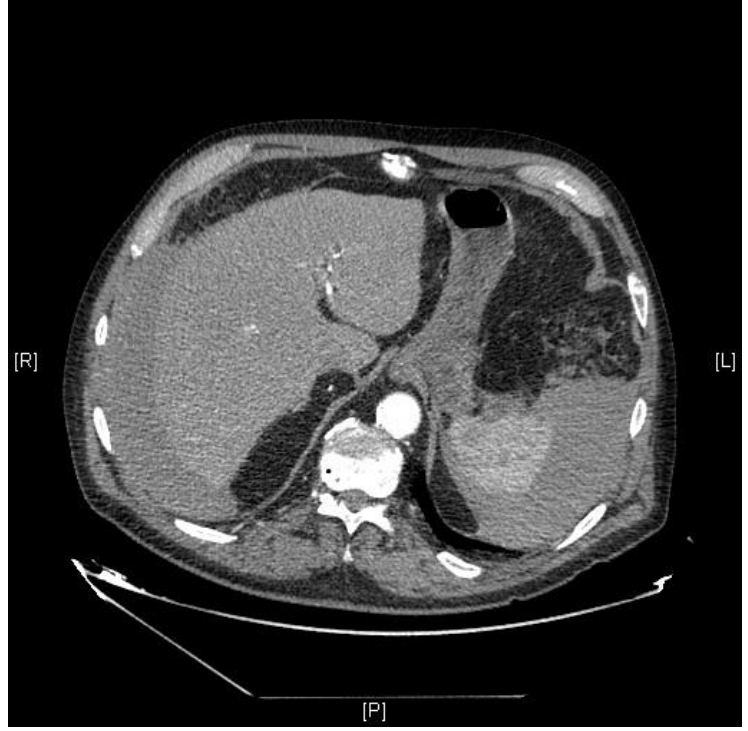
Figure 1: Perihepatic and perisplenic hemoperitoneum