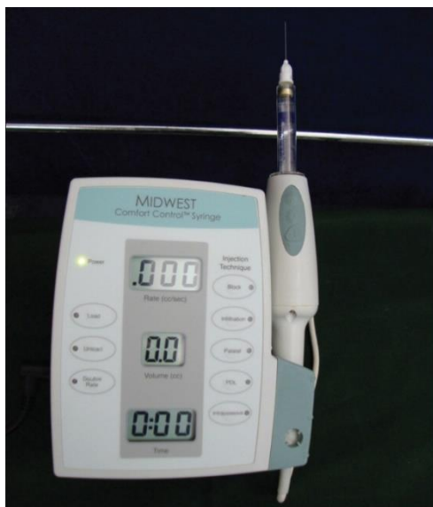
Figure 2. Comfort Control Syringe.

Clinical evaluations were carried out in each eligible patient before commencement to evaluate whether sensitivity was already present. Patients who were suffering from sensitivity prior to cavity preparation were not included in the study. Patient who reported sensitivity during cavity preparation underwent sensitivity testing procedures. Sensitivity was evaluated using a calibrated pulp tester by a trained examiner who was blinded to the study groups. The subjects were then injected with 2% lignocaine with 1:80,000 adrenaline, using the allotted injection technique; 0.2