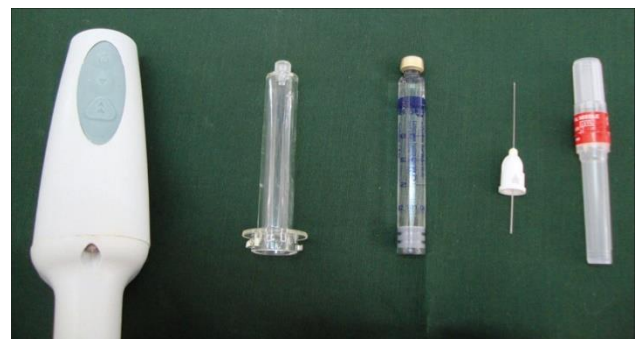
Figure 3. Parts of Comfort Control Syringe Handpiece.