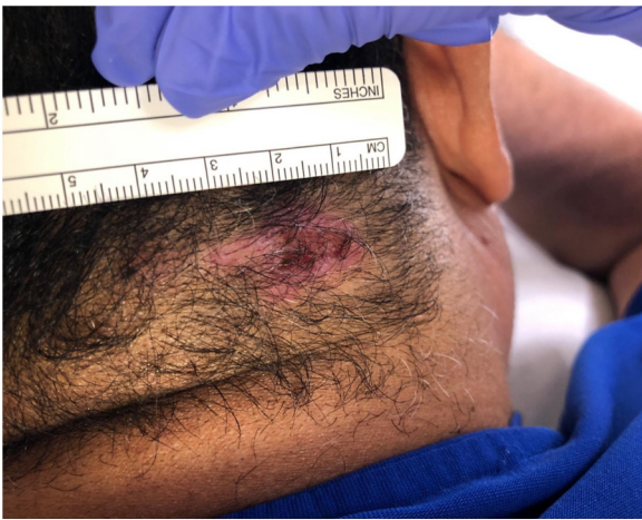
Fig. 2. Erythematous plaque (2.5 × 1.5 cm) with sharp borders with hemorrhagic crusting and ulceration over the right occipital scalp.

the pleural fluid. Extensive culture and staining for bacteria, fungi, and acid-fast bacilli were negative. Pathology analysis of the lingula biopsy revealed granulomatous inflammation and previously done staining was repeated for this sample which was negative for bacterial, fungi, or mycobacterial elements. Given the inconclusive investigations with no definitive etiology and no major symptoms except for pleuritic chest pain, supportive management geared towards symptom control was pursued with the plan for close monitoring and imaging follow up.