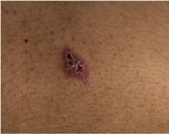
Fig. 1. Erythematous plaque (1.5 × 1 cm) with hemorrhagic crusting and ulceration over the left shoulder.