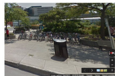
Image 9: Bicycle facilities (bike share and bike racks) (Yes/No): A bicycle rack is present. Image capture Aug 2017