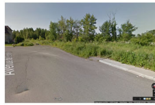
Image 1: Sidewalk continuity (Yes/No): The sidewalk is not continuous throughout the entire segment.