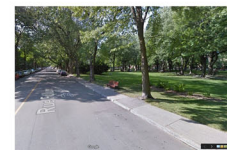
Image 12: Visible nature areas (e.g., lakes, rivers, parks) (Yes/No): A park is present. Image capture Aug 2016