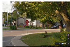
Image 4: Stop sign (Yes/No): A stop sign is present at the intersection. Image capture Aug 2015