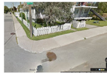
Image 2: Curb cut quality (Good quality/Bad quality): This curb cut is of bad quality. Image capture Aug 2016 © 2017 Google