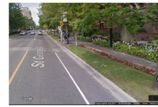
Image 3: Sidewalk buffer (Yes/No): A sidewalk buffer is present. Image capture Aug 2017 © 2018 Google