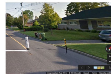
Image 6: Bollards (Yes/No): Bollards are present. Image capture Aug 2015