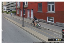
Image 8: Bicycle buffer (Yes/No): A bicycle buffer is present. Image capture Jul 2017