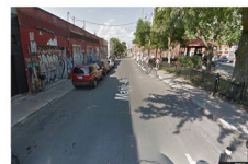
Image 10: Graffiti (None/Some/A lot): Large amounts of graffiti present. Image capture Aug 2016 © 2017 Google