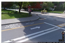
Image 7: Bicycle lane (Yes/No): A bicycle lane is present. Image capture Aug 2017