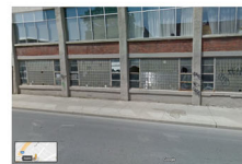
Image 11: Broken/boarded windows (Yes/No): Broken windows are present. Image capture Aug 2011