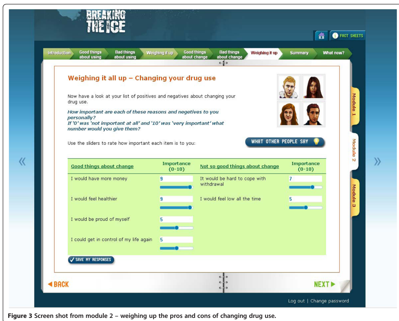
Figure 3 Screen shot from module 2 – weighing up the pros and cons of changing drug use.

report of drug use without the potential to use biochemical verification (i.e. urine samples) as often used in face-to-face intervention trials. Nevertheless, there are data to support the reliability and validity of self-reported illicit drug use: indeed self-reports can reveal a greater extent of drug use than biochemical screening, with most illicit drugs only detectable for a short period [49].